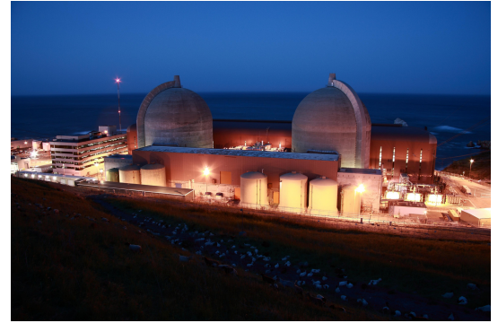
Diablo Canyon in California is among several carbon-free, baseload-producing nuclear power facilities that have closed in recent years.

Not surprisingly, nuclear is the most heavily unionized part of the energy sector and its most diverse. Thirty-six percent of the workforce are women and 34% are people identifying as a racial and ethnic minorities.